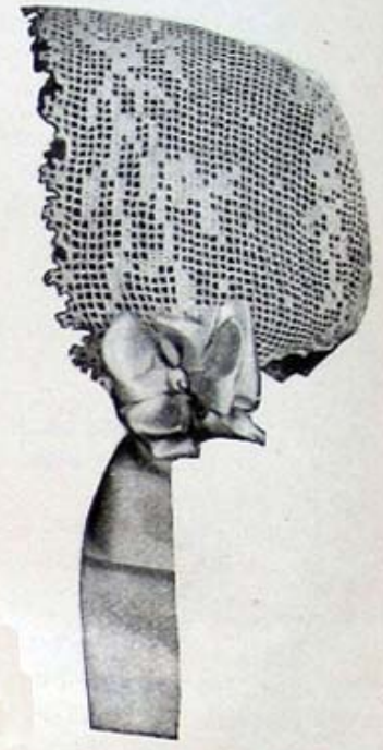
Even the baby wears filet. A baby cap in filet crochet